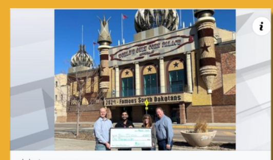
dakotanewsnow.com Mitchell's $1,000 relocation initiative receives additional funding after successful launch