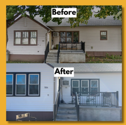
Housing Rehab Project