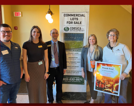
Corsica/Armour Day at the Legislature