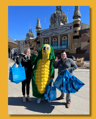
Drive-Through Hiring Event