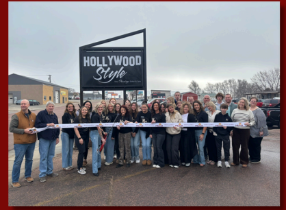
Ribbon Cutting at Hollywood Style