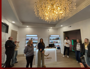
First Friday Coffee at Optimal Tan