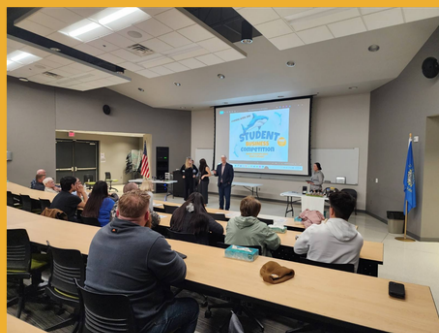
Student Business Competition