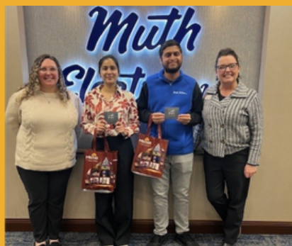
Move to Mitchell Program