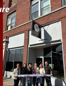
Ribbon Cutting at Shear Perfections