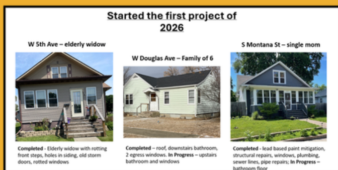
MAHI Rehab Projects