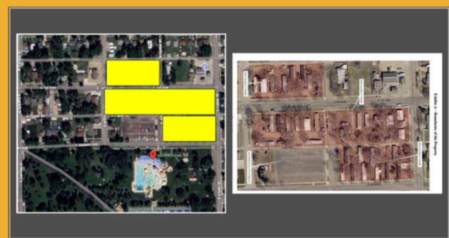
1 st Ave Development