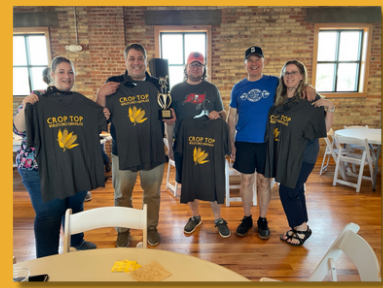
Young Professionals Trivia Night