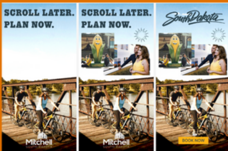
Banner Ad Example