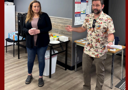
First Friday Coffee at Short Staffed