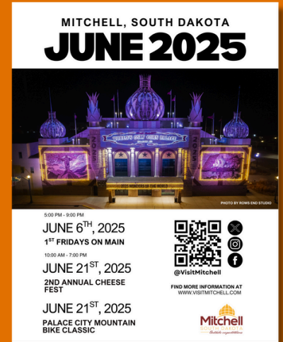
June 2025 605 Ad