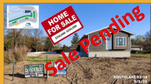
Governor's Home on South Lake