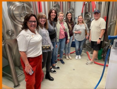
IRU Guides Visiting Mitchell