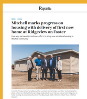
Ridgeview on Foster Home