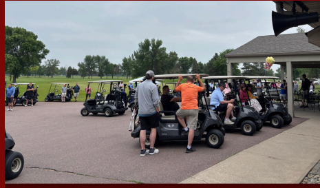
22 nd Annual Chamber Golf Tournament